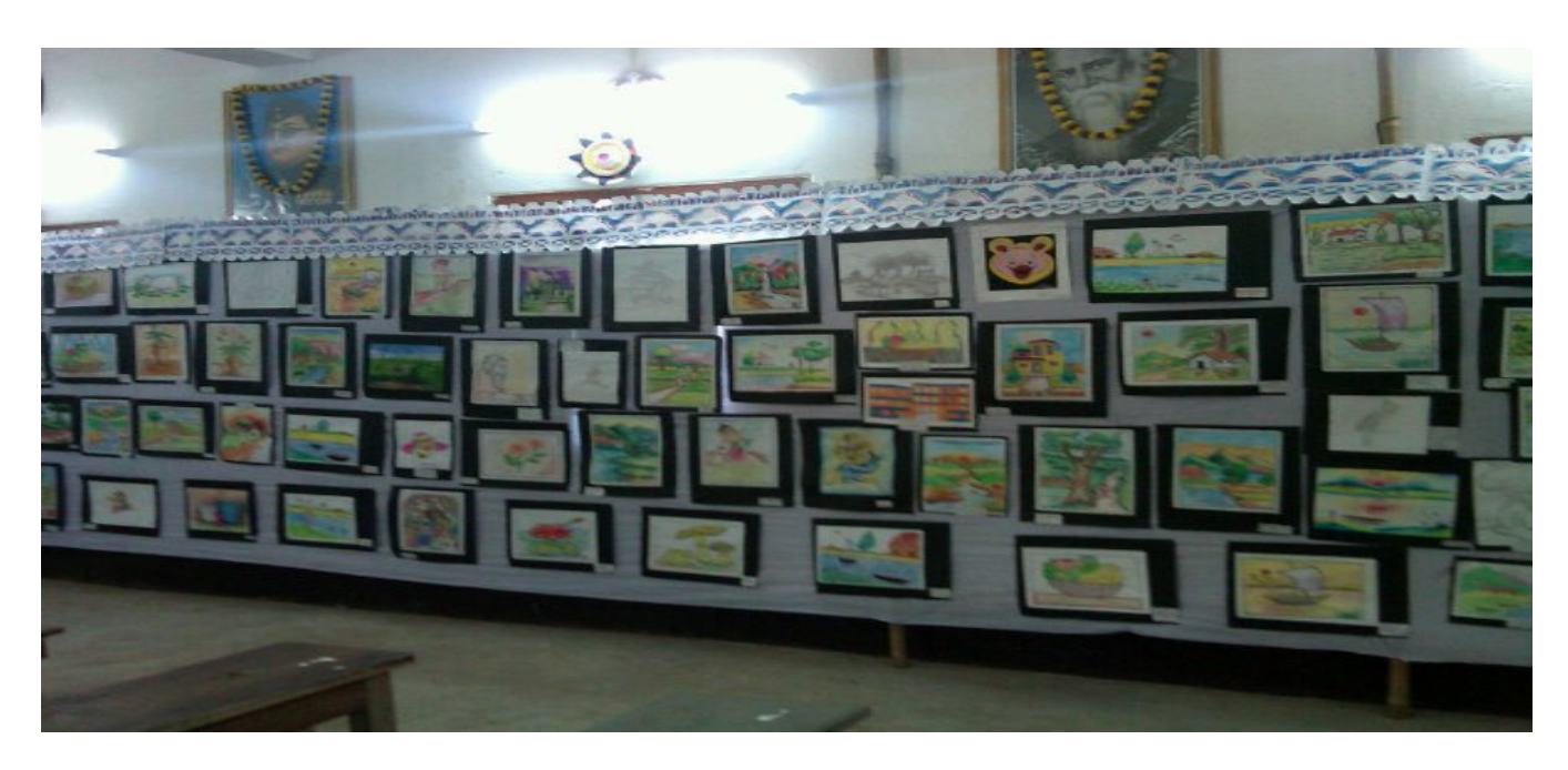
Picture (above): Deenabandhu Day Decoration with artwork performed by Deenabandhu Students Picture (below): Deenabandhu Day Celebration at Medinipur on January 2, 2011

Deenabandhu Trust has been celebrating Deenabandhu Day on 2<sup>nd</sup> of January every year for the past 3 years in Midnapore. This year, as part of Deenabandhu day celebrations, several competitions and cultural events will be conducted involving students from the school in Midnapore District in WB and Bhubaneswar in Orissa.