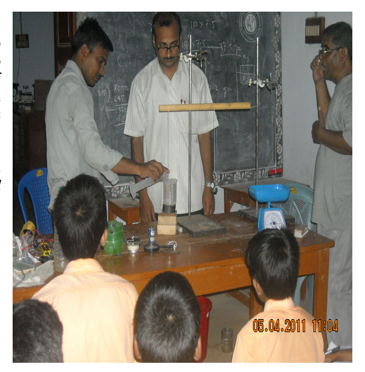
Photo (right): Loss of weight of objects when immersed in water being demonstrated (Archimedes Principle)

Deenabandhu Trust has started a Science Club for the students of Midnapore Town School to enable them to grasp the practical aspect of science in day-to-day life. Students are given hands-on training on making models using basic concepts learnt in their school curriculum.