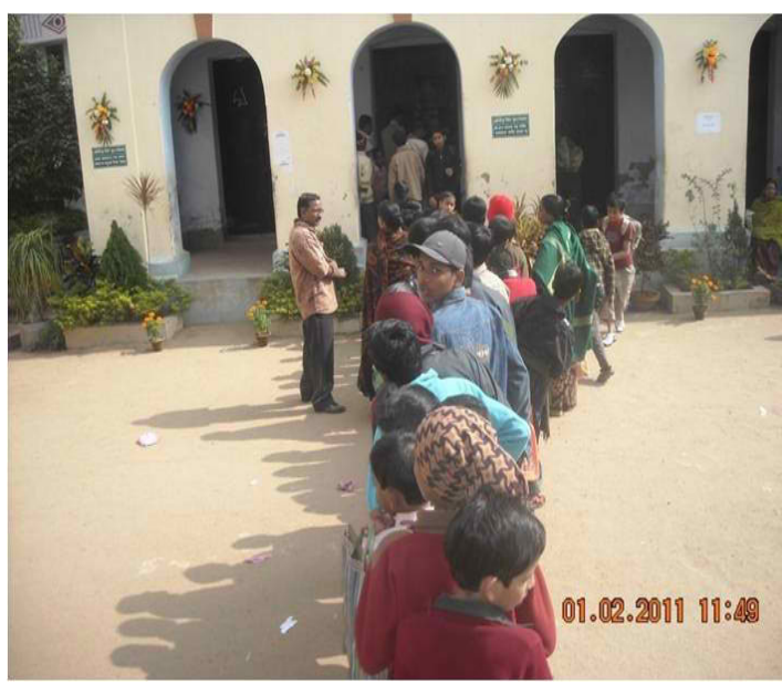
Photo above: Blood being drawn for blood grouping Photo above: Free Health check up of students being conducted at Midnapore