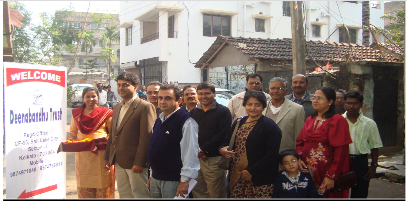
CTS Team visited Chingrighata Tutorial Center

A new building was leased for the tutorial center at Chingrighata, near Salt Lake in Kolkata. This tutorial center provides education support to children of rickshaw pullers, domestic maids, street hawkers, taxi drivers etc